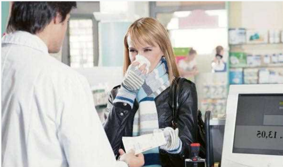
Nasal Congestion Sinus Problems

The information provided in this information had been created for educational purposes only all of which will not used to identify or treat any kind of health issues. Examples of vaporizers with good ceramic heating elements: Vapor - Brothers, Phedor and also Hotbox. Not that, the reduced p - H may slow the imitation of pests like thrips. They will more than likely help to destroy up virtually any mucous within your program making your cough more productive. Nasal congestion is due to chilly, flue or allergy or perhaps as a result of dry air and also air pollution. Changing your sleeping position can sometimes be need to ease your snoring.