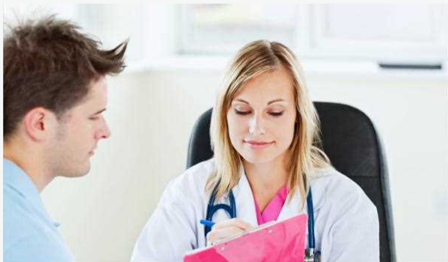
SinusitisSinus InfectionChronic SinusitisChronic Sinus

When you are looking at persistent sinusitis, therapy is essential as a result of the risk of the infection spreading to other parts of the head and body. The infection can spread to the ears, producing temporary (and sometimes permanent) hearing loss as well as the eyes which could lead to temporary or permanent perspective loss. In extreme cases, chlamydia can spread to the brain and spinal cord, which may always be fatal.