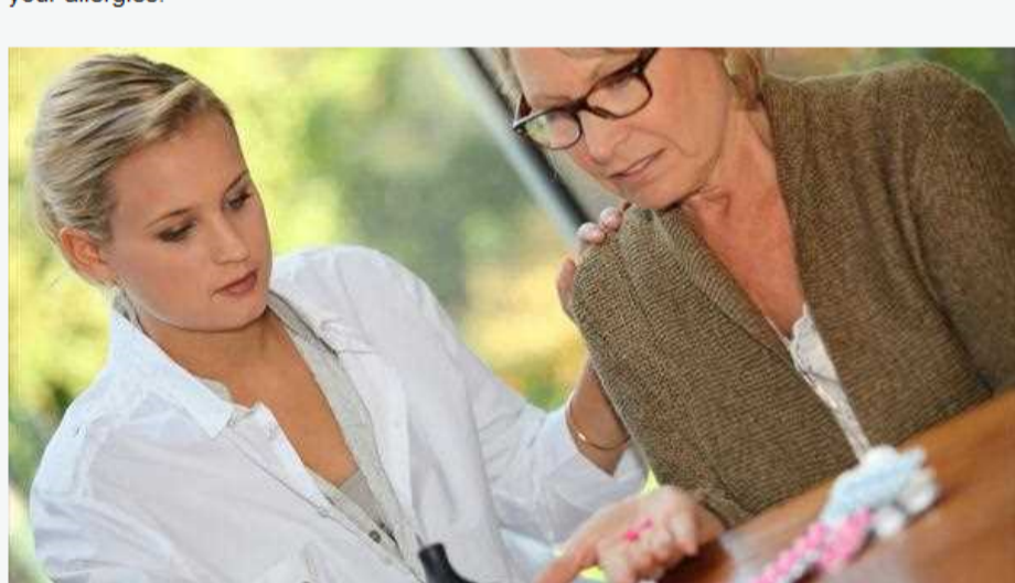
Fluid in Sphenoid Sinus

Now, after getting talked about sinus medication, another thing that is important to think about is the cause of your sinus issues. Reduction is a better cure, right? It would be infinitely better when you had not started to suffer the symptoms of a sinus problem in the first place. So what are the causes of nose problems? Allergies is one way that they start. If you think that might be the cause of yours, then find the types of things that cause your allergies.